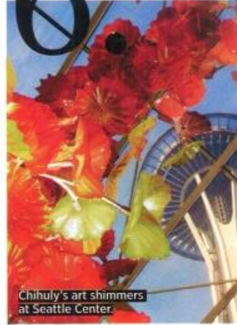
Chihuly's art shimmers at Seattle Center.